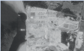
BBMT showing oil and gas platform assembly and transfer barges (circa 1983)