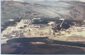
BBMT (circa 1970s)

BBMT was built to support the development and operation of the Gippsland Basin oil and gas fields.