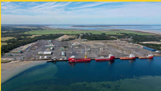
BBMT with 4 SOVs alongside