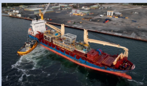
BBC Everest and SOV Skandi Feistein alongside BBMT, 2024