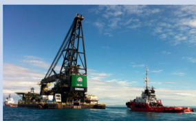
McDermott Derrick Barge 30 approaching Corner Inlet (circa 2011)