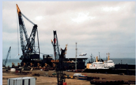
BBMT with DB 29 and helicopter taking off during Bream A Construction project (1987)