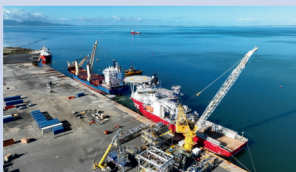
BBC Everest berthing at BBMT, 2024