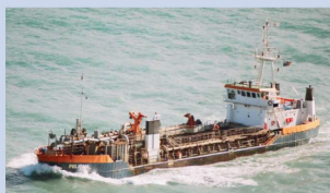
Trailing Suction Hopper dredge "Pelican" Corner Inlet (circa 2010)