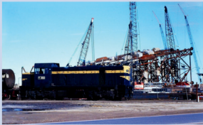
BBMT showing train delivering combustible liquid, oil and gas platform assembly and transfer barges (August 1981)

Oil and gas platforms were assembled and launched from the facility.